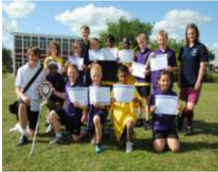
Swallow Dell, Winners

On the 17 th June the Year 6 Rounder's Festival was held at Sir Frederic Osborn School. 13 schools entered the festival and in attendance were Swallow Dell, Watchlytes, St Johns Lemsford, Oaklands, Holy Family, Welwyn St Marys, Harwood Hill, Homerswood, Creswick, Rowans, Applecroft, Panshanger and St Johns Digswell School's.