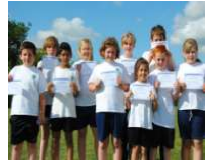
Runners Up, Homerswood

Teams were split into round robin groups with four teams progressing through to the Semi Finals. On the day Swallow Dell, Harwood Hill, Homerswood and Applecroft made it through. The final was contested between Swallow Dell and Homerswood and it was Swallow Dell who came out on top to win the event.