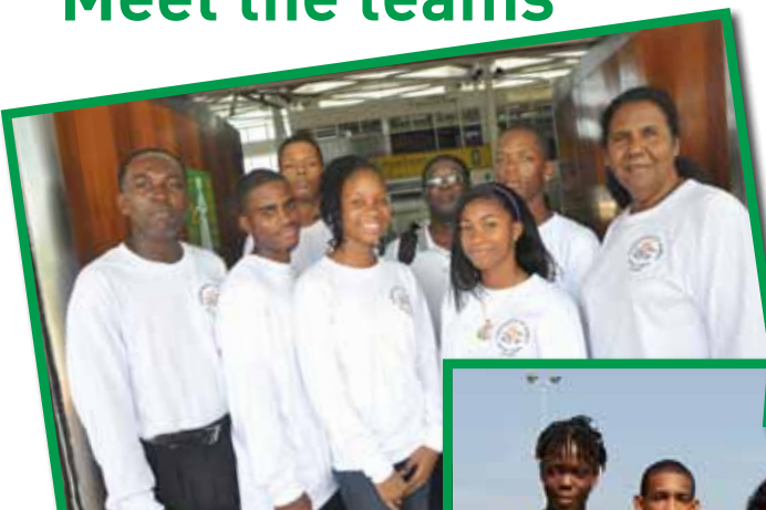
British Virgin Islands Commonwealth Youth Team