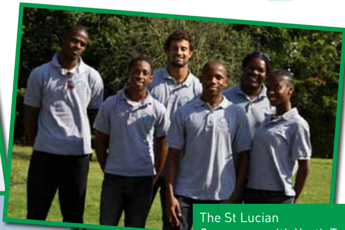
The St Lucian Commonwealth Youth Team