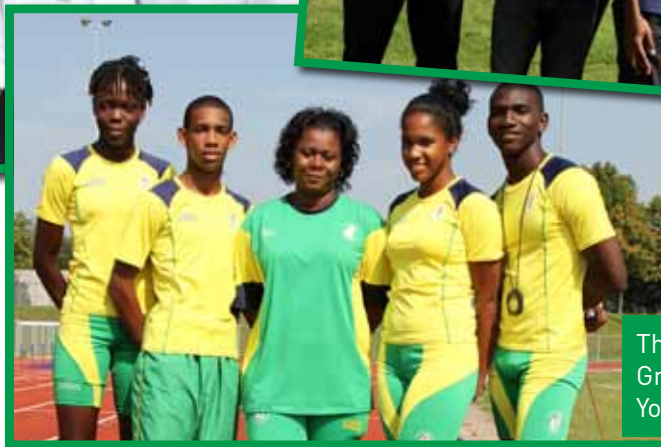
The St Vincent and the Grenadines Commonwealth Youth Team