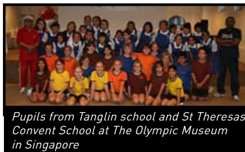
Pupils from Tanglin school and St Theresas Convent School at The Olympic Museum in Singapore