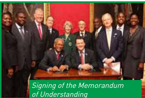
Signing of the Memorandum of Understanding

Hertfordshire is Ready for Winners' 2009 agreement with the British Virgin Islands National Olympic Committee for their athletes to train in Hertfordshire Pre London 2012 has taken a further step towards official friendship with Hertfordshire County Council and the British Virgin Islands Government signing a Memorandum of Understanding of their own, to develop formal links between a range of organisations in the British Virgin Islands and Hertfordshire.