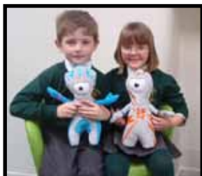
The Mascots at The Russell School

A school twinning programme inspired by the London 2012 Olympic and Paralympic Games has seen the mascots Wenlock and Mandeville travel half way around the world.